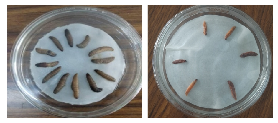
Plate 3. Galleria mellonella larvae infected with (A) Steinernema spp. (B) Heterorhabditis spp.