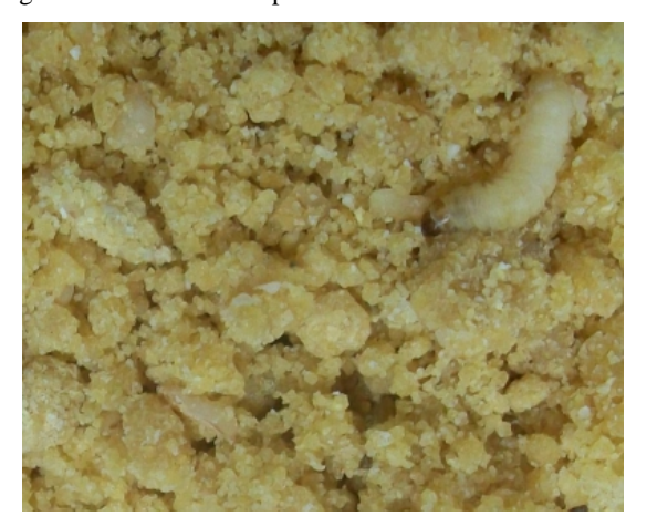
Plate 2. Galleria mellonella culturing in artificial diet.

Insect-baiting and nematode culture: According to Bedding and Akhurst's original report (1975), insectbaiting was undertaken. Each glass bottles containing soil samples received ten G. mellonella larvae in their last instar, which were subsequently inserted and incubated at 25\pm2^{\circ} C. Regular inspections were conducted on the samples to assess for successful insect infection and soil moisture. Until infective juveniles (IJs) emerged, all collected cadavers were cleaned with distilled water and placed in a White trap (White, 1927). Next, IJs were collected, cleaned, and kept in storage at 16\pm2^{\circ} C. Re-inoculation of G. mellonella larvae was